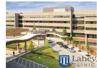
Current Lahey Clinic, 2011 41 Mall Road, Burlington, MA