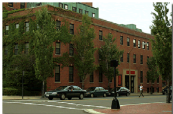
Original Lahey Clinic Facility, 1923 605 Commonwealth Ave, Boston Ma