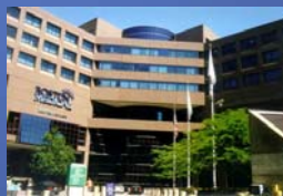
BMC Newton campus (Former University Hospital)