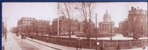
Boston City Hospital, circa 1903