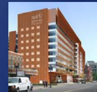
BMC Shapiro Center