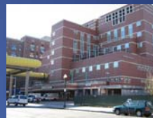
BMC Menino campus (Former Boston City Hospital)